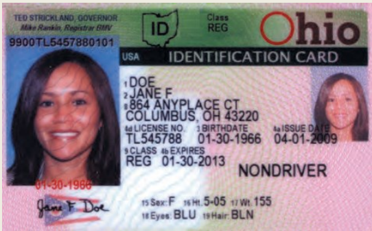
State Identification Cards